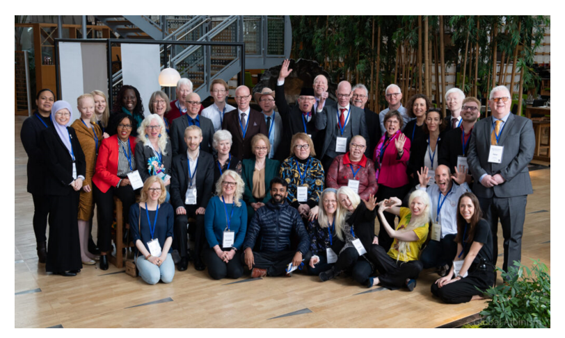
January 2020, Paris France